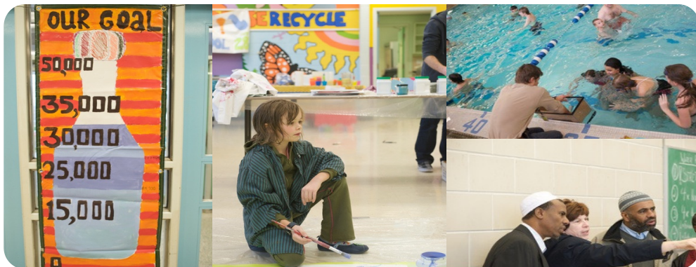
Earl Grey Fundraiser