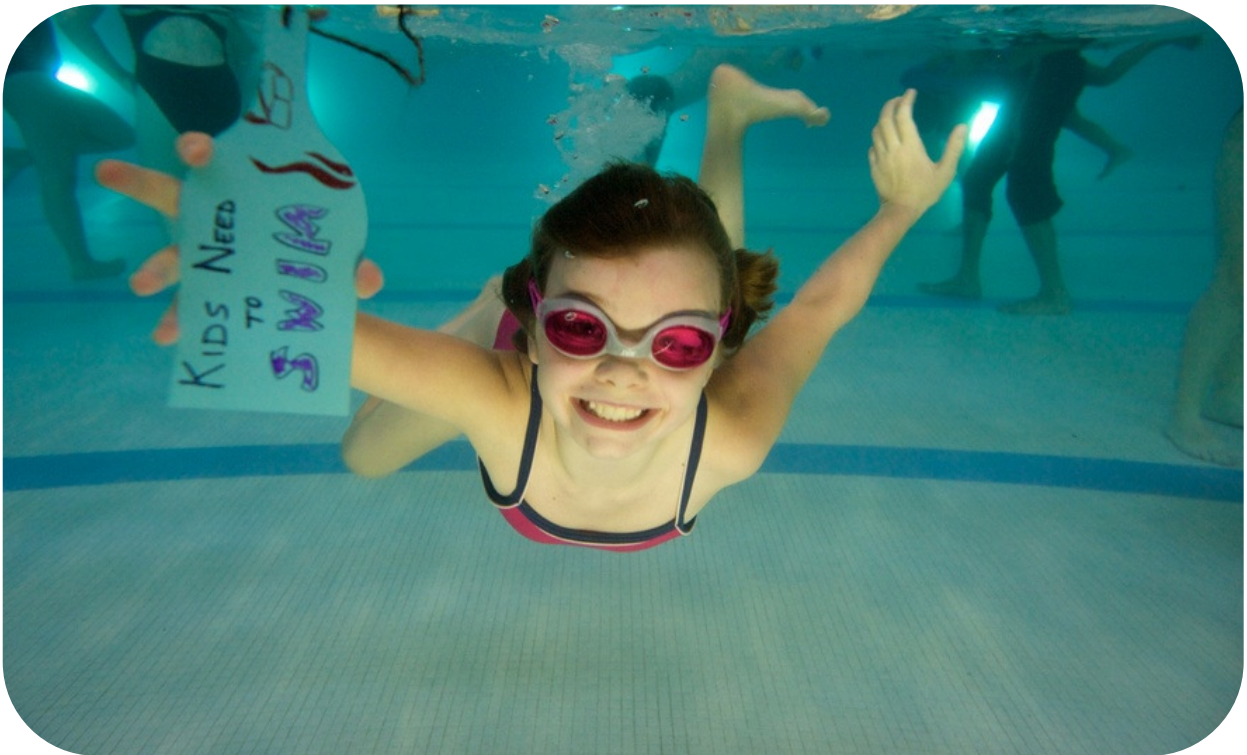
Fundraiser at Earl Grey (November 28, 2009), Photo courtesy of John Beebe

Aquatics Working Group report to the Toronto Lands Corporation January 2010