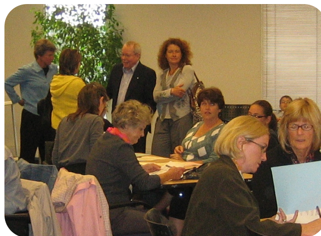
AWG Meeting September 29, 2009