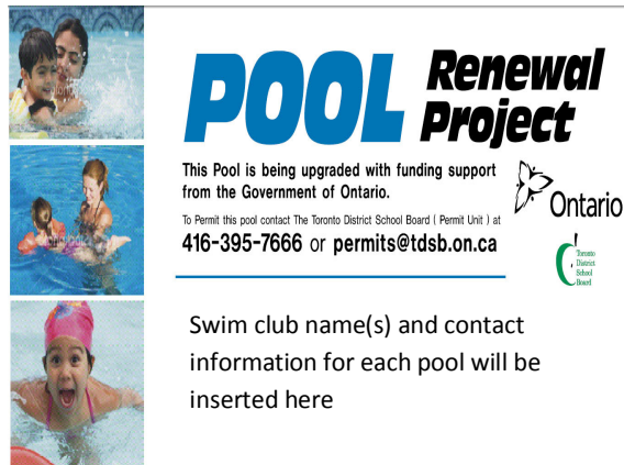
Example of new, permanent pool signs

OUTCOME 5: New permanent pool signage at schools, and temporary signage at some probationary schools.