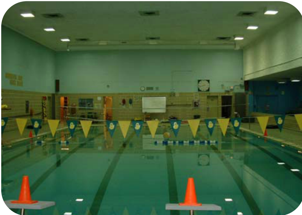
Monarch Park Pool

Not all pools are the same, and not all pool users have the same needs. We can make the best and most use of TDSB pools if we make an effort to understand and match the different characteristics of each pool with the unique needs of different user groups.